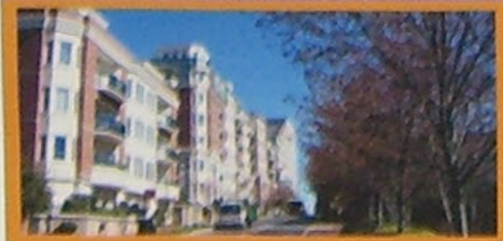
New Urbanism Residential

Uptown Wards OPPORTUNITIES: - 4 Unique city sections - Growth beyond freeway